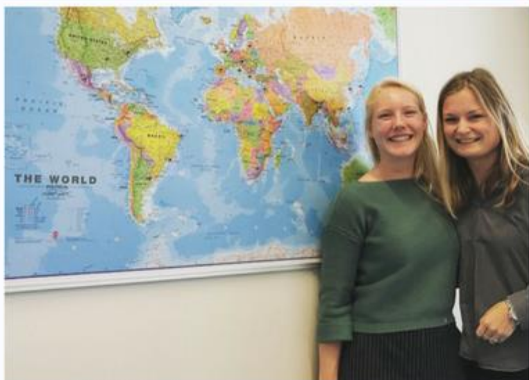
The updated RSV GOLD world map where we collected cases in 36 countries!

If you have any questions about this project or if you are interested and willing to share data with us, please do not hesitate to contact us.